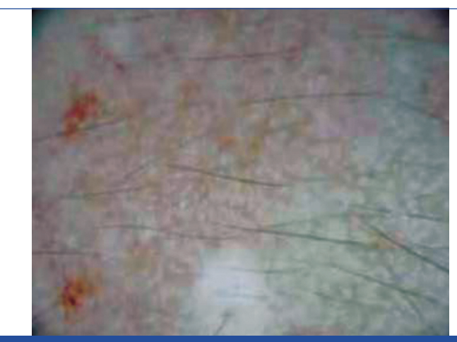
[Table/Fig-13]: Mixed pattern of dermoscopy of melasma