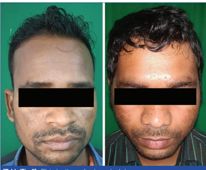
[Table/Fig-8]: Clinical patterns of melasma (malar)

[Table/Fig-7]: Showing duration of disease in the patients (n=245