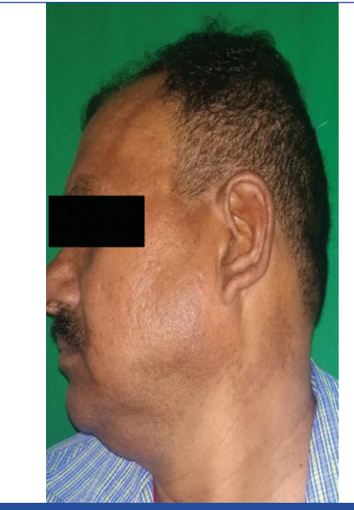
[Table/Fig-10]: Clinical pattern of melasma (mandibular).

Among the cases, 115 (46.9%) had a MASI Score between 5-10. The average MASI Score was 8.7±7.71 [Table/Fig-14]. Among the cases (n=245) the maximum number of cases had a MASI Score between 1-10, 189 cases (77.1%) and among them (n=189) the most common skin type was IV, 97 cases/189 (51.3%) [Table/Fig-14,15].